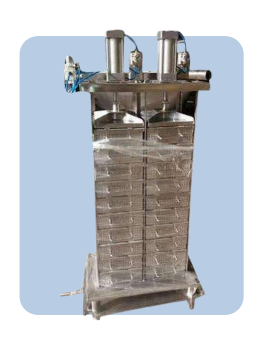
PNEUMATIC PANEER PRESS MACHINE