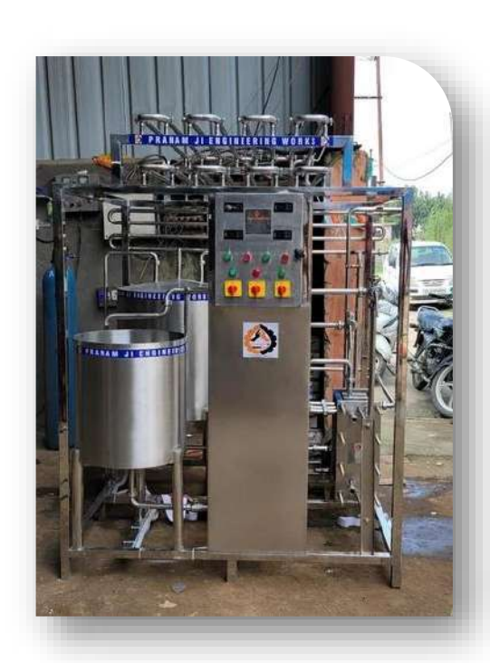
COMPACT MILK PASTEURIZER