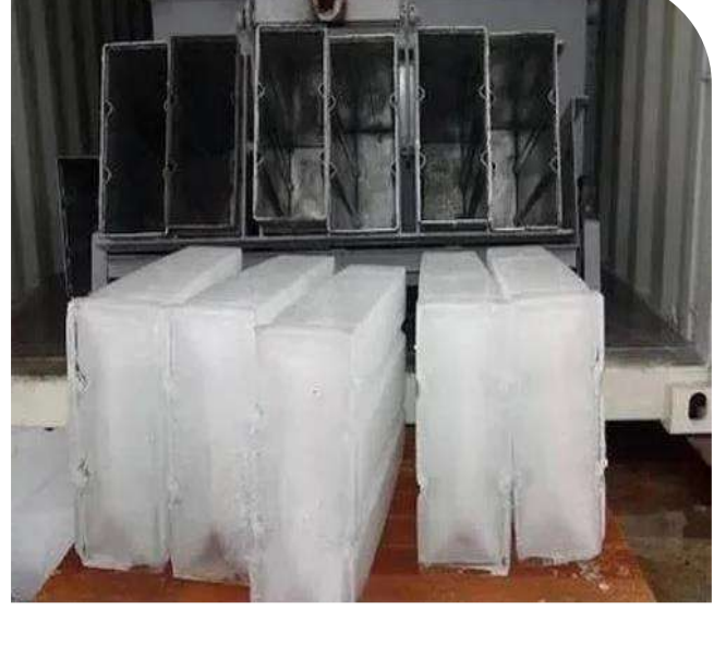
ICE MAKING PLANT