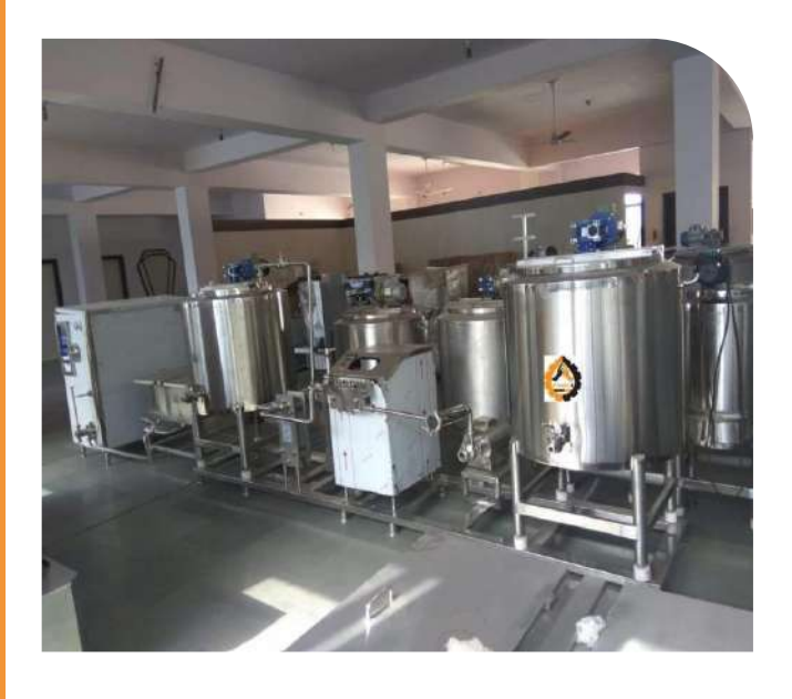
ICE CREAM PLANT