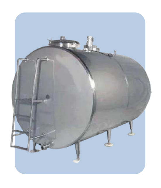
SS MILK SUPPLY TANK