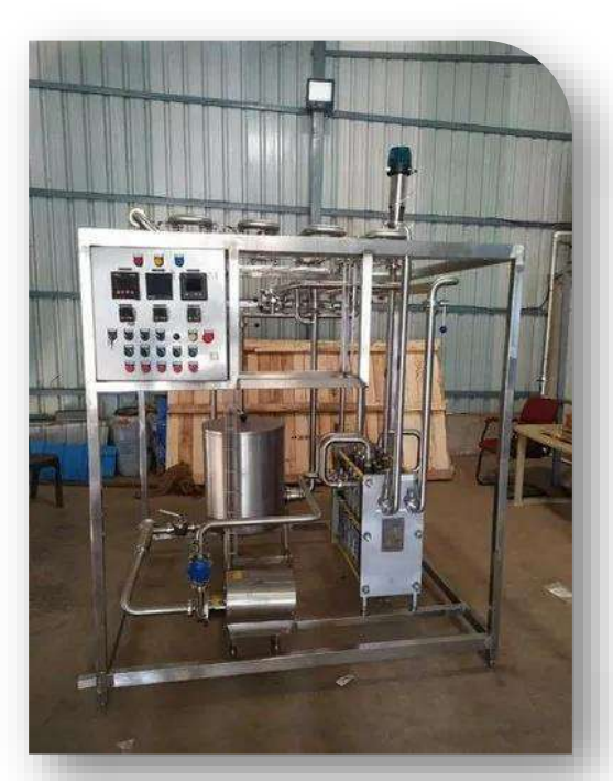
HOMOGENIZER MILK PROCESSING PLANTS