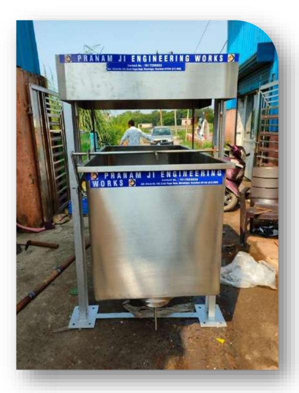
ICE CREAM PLANT