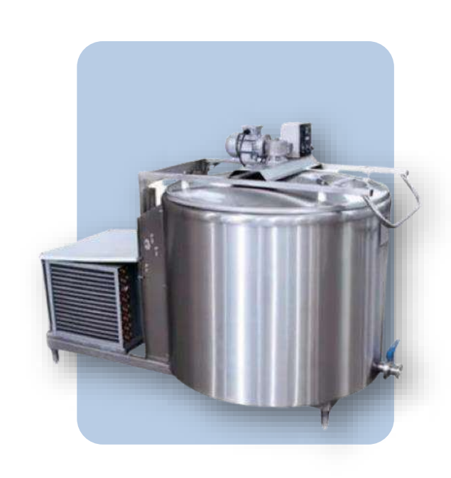
BULK MILK COOLER