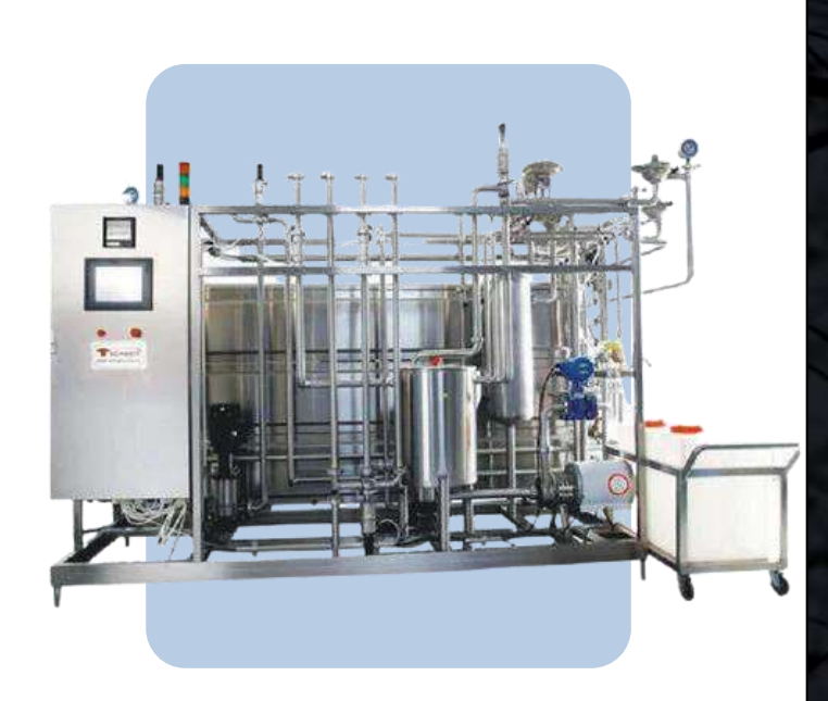
GHEE MAKING PLANT