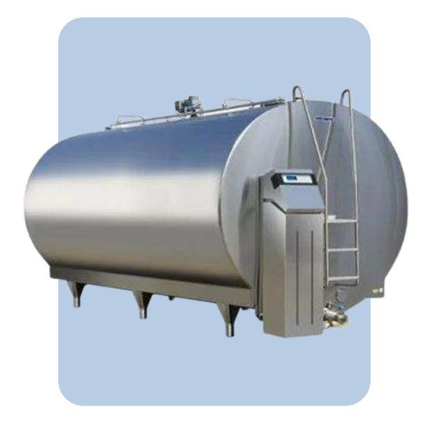
HORIZONTAL MILK SUPPLY TANK