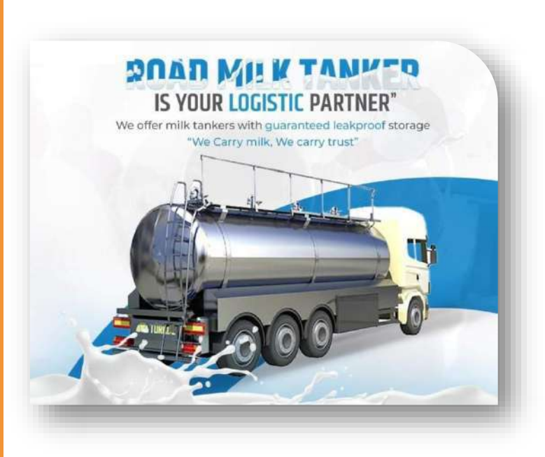
ROAD MILK TANKER