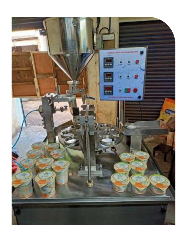
CUP FILL MACHINE