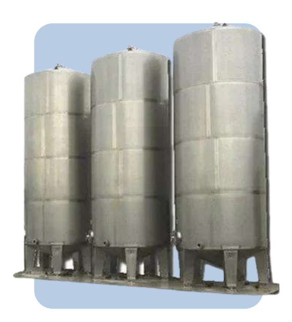
SS MILK SILO