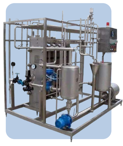
MILK PASTEURIZER 220 V