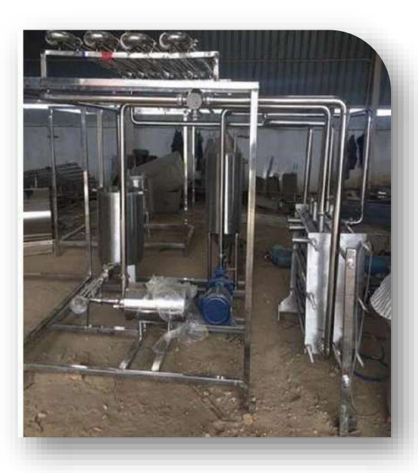
AUTOMATIC MILK PASTEURIZER PLANT