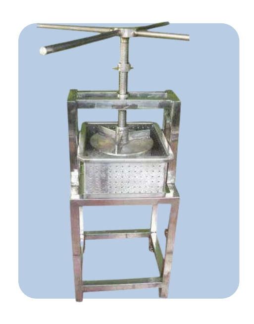
PANEER PRESS MACHINE