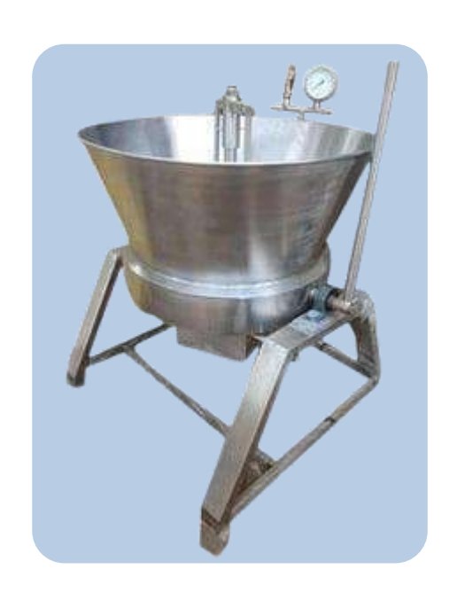
KHOYA MAKING KETTLE