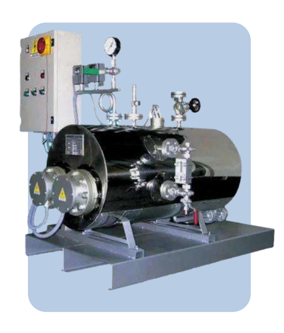
ELECTRIC STEAM BOILER