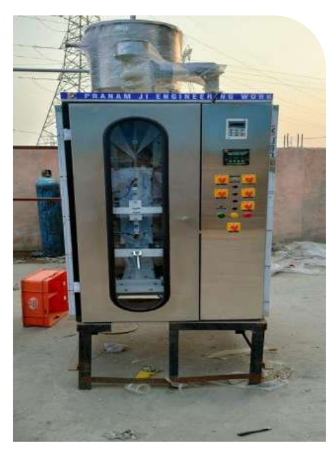
POUCH PACKAGING MACHINE