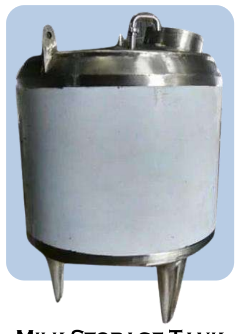
MILK STORAGE TANK